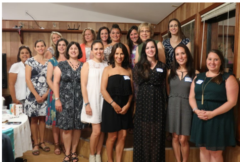
MOMS 33 Participants

“ MOMS has been an extraordinary spiritual experience for me. I have not only met a wonderful group of mothers, but I have also been able to relate similar feelings, thoughts and concerns about motherhood with women who are also new Moms. I cannot express how thankful I am to be part of such a fantastic group.”